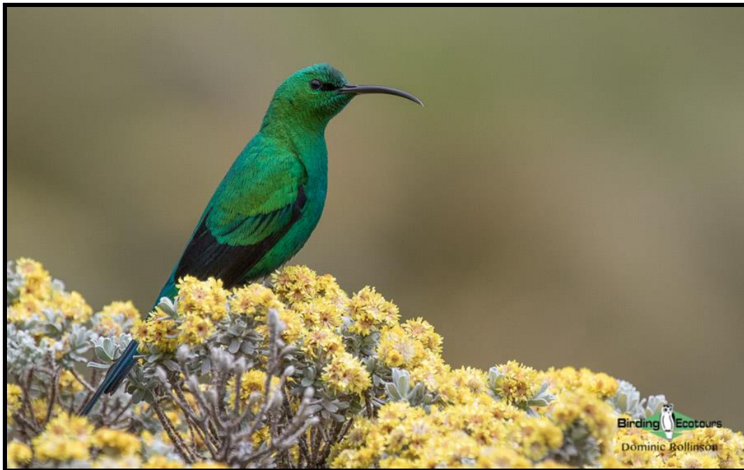
Malachite Sunbird is usually seen on this tour

Overnight: Linger Longer Country Retreat near Dullstroom