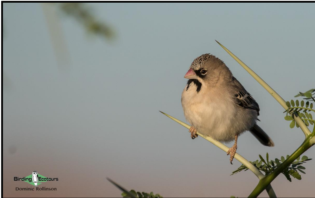
Scaly-feathered Finch: we often find these towards the end of our tour

Overnight: Zenzele River Lodge 1.5 hours' drive from Johannesburg airport