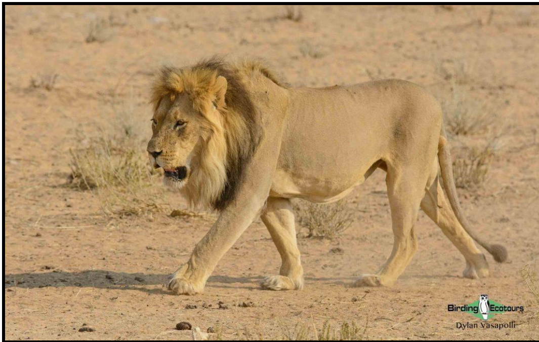
Lion, and with luck Leopard and Cheetah should be encountered on this tour

Join the Tucson Audubon Society in South Africa! We spend 10 days in one of South Africa's richest areas for birds, mammals and other wildlife, in one of the world's most famous game parks, the Kruger National Park. This massive park covers a vast area and is teeming with Africa's big (and small) mammals (including African Elephant, Giraffe, Burchell's Zebra, Lion, Leopard, Cheetah and all the others). The great thing for birders, though, is that it's full of easy to see, spectacular-looking species, such as several species each of roller, bee-eater, kingfisher, hornbill, vulture, owl, stork, etc. The park is full of birds of prey including the spectacular, colorful Bateleur , and there's also a good chance of finding Secretarybird, Kori Bustard (the world's heaviest flying bird), Southern Ground Hornbill (along with a plethora of other hornbill species), etc.