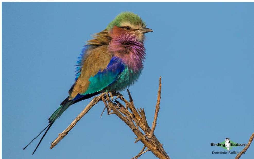
Lilac-breasted Roller abounds in the Kruger National Park