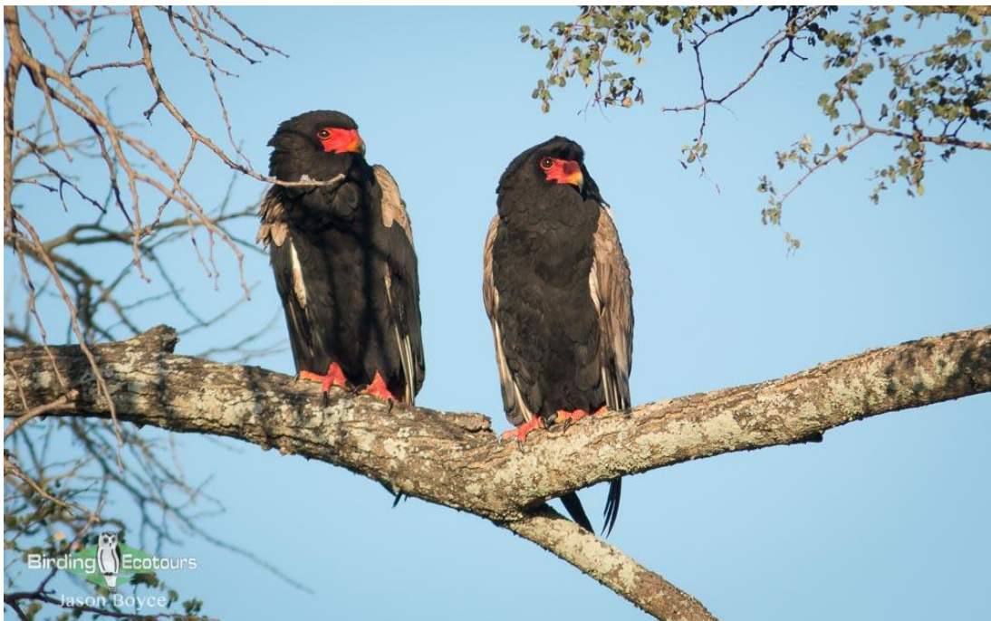
Bateleur , a colorful, acrobatic eagle that is still common in the Kruger National Park but now very rare outside of large game parks

How to book: to make a booking, you can kindly go to https://www.birdingecotours.com/make-a-booking/ or e-mail info@birdingecotours.com . We will then also inform you how to pay your 25 % deposit to firm up your booking. Most people pay this by mailing a check at the prevailing exchange rate (which we'll give you) to our Ohio office (which we'll also give you details of when we get your e-mail or online booking). The 75 % balance is due two months before the trip starts.