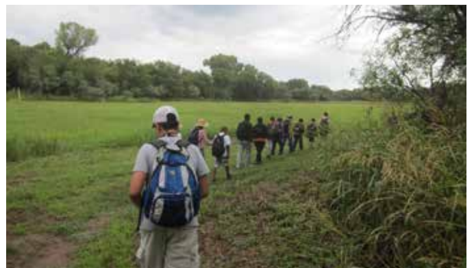
Trekking Rattlers exploring southeast Arizona