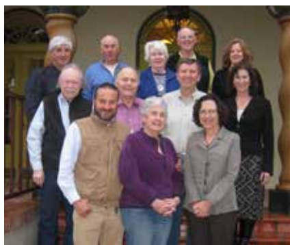
Tucson Audubon Society Board of Directors