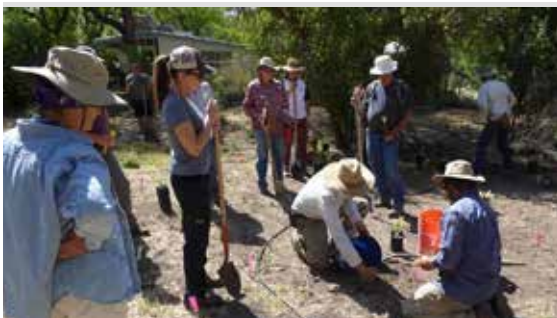
Installing a monarch waystation at Paton's Center for Hummingbirds