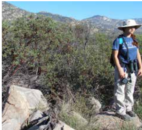
Yellow-billed Cuckoo Survey, Rincon Mountains

Salvaged 15 Saguaros, 15 barrel cactus, 5 hedgehog cactus, and 70 pincushion cactus from road expansion along Cortaro Rd