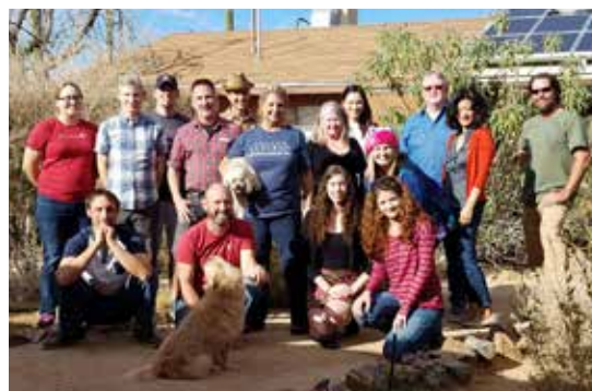
Tucson Audubon Society Staff, December 2016