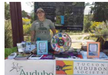
Grand Canyon IBA event, October 2016

377 volunteers put in 9,627 volunteer hours